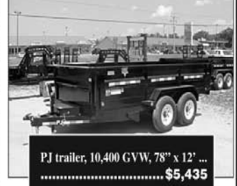
PJ trailer, 10,400 GVW, 78" x 12' ... $5,435

Reeman Farm Equipment 7180 W. 48th St., Fremont, MI 49412 231-924-2570 • 800-215-5100