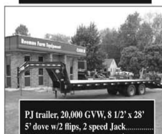
PJ trailer, 20,000 GVW, 8 1/2' x 28' 5" dove w/2 flips, 2 speed Jack..... $8,730