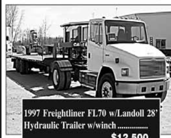
1997 Freightliner FL70 w/Landoll 28' Hydraulic Trailer w/winch ..... $12,500