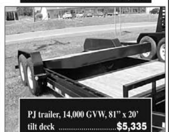
PJ trailer, 14,000 GVW, 81" x 20' tilt deck ..... $5,335