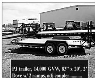
PJ trailer, 14,000 GVW, 83" x 20', 2' Dove w/ 2 ramps, adj coupler..... $4,160