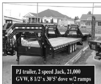
PJ trailer, 2 speed Jack, 21,000 GVW, 8 1/2' x 30' 5" dove w/2 ramps ..... $7,785