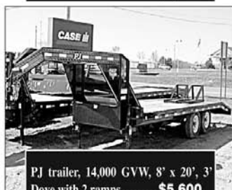
PJ trailer, 14,000 GVW, 8' x 20', 3' Dove with 2 ramps..... $5,600