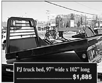
PJ truck bed, 97" wide x 102" long ..... $1,885