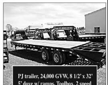
PJ trailer, 24,000 GVW, 8 1/2' x 32' 5" dove w/ ramps, Toolbox, 2 speed Jack ..... $10,340