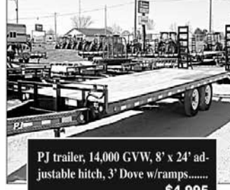
PJ trailer, 14,000 GVW, 8' x 24' adjustable hitch, 3' Dove w/ramps..... $4,995