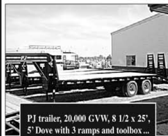
PJ trailer, 20,000 GVW, 8 1/2' x 25', 5' Dove with 3 ramps and toolbox ..... $8,325